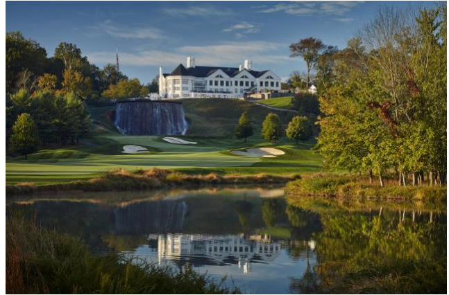
The Trump National Golf Club in Sterling, VA