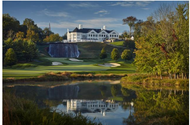
The Trump National Golf Club in Sterling, VA