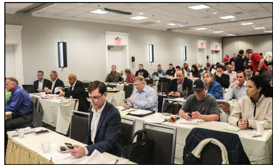
Attendees listen to a presentation at WANADA's Identity Theft Prevention Seminar, held Feb. 20 at the Pooks Hill Marriott in Bethesda.