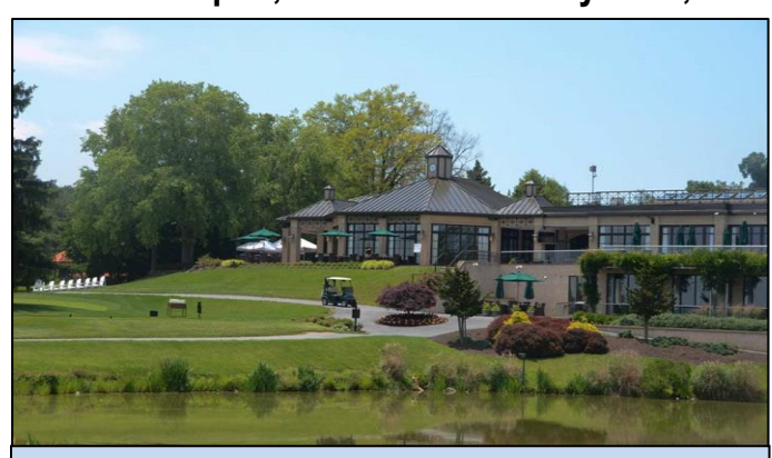
A view of the pastoral Lakewood CC clubhouse from the championship golf course.