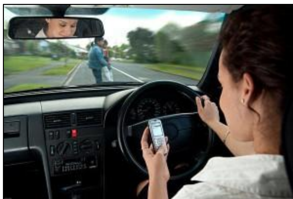
A Bridgestone study found that 95 percent of teens read texts and emails while driving.

The guidelines were issued on the same day as a Texas A&M study showing that voice-activated texting is no safer than typing a text. No matter which texting method was used, drivers took twice as long to react as when they weren’t texting. And a survey by Bridgestone found that 95 percent of teens read texts and emails when driving alone, but only 32 percent do so around friends and just 7 percent when they’re with parents. The survey found similar figures for teens posting on social media sites while they drive.