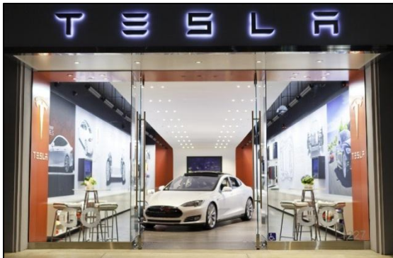
Tesla store in Santa Monica, Ca.