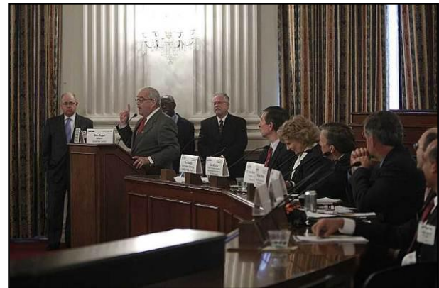
Rep. Gerry Connelly (D-VA) greets attendees at the Green Car Summit

The Washington Auto Show (WAS) was once again host to the Green Car Summit in partnership with the Green Car Journal where