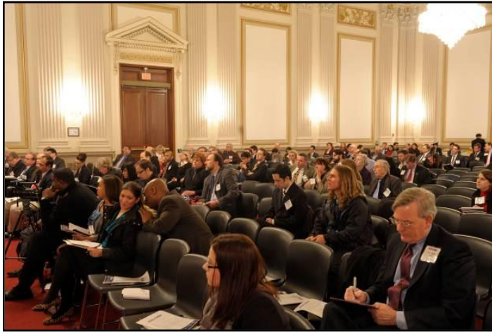
The 2011 WAS Green Car Summit, Cannon House Office Bldg.

with Warren Brown, automotive columnist for The Washington Post.