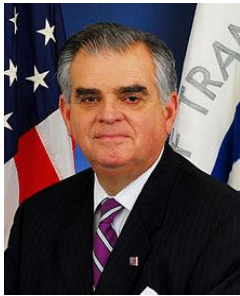
Transportation Secretary Ray LaHood

Public Policy Day at The 2012 Washington Auto Show next Thursday Jan. 26 is shaping up to be a bell-to-bell, morning til’ dark program with continual OEM and U.S. Government announcements and press conferences. And when the day is done, major evening events roll out, commencing with the Sneak Peek Preview and WANADA Member Reception, all capped off by the Automotive News Lifetime Achievement Award Dinner recognizing auto dealer extraordinaire and racing icon Roger Penske.