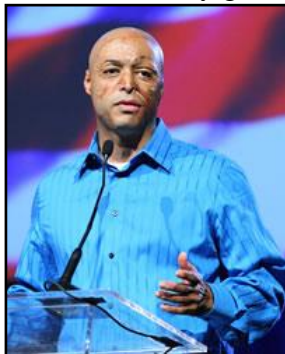
J.R. Martinez Dancing with the Stars winner

The WAS, produced by the Washington Area New Automobile Dealers Association will offer free admission for all active-duty military coming out and presenting a military ID on Auto Show Tuesday. At 6 pm that evening, a special Veterans Reception and Press Conference will feature celebrity guests, musical entertainment and information from automakers about vehicle discounts and career tracks for military personnel. A featured non-profit partner of the celebration is the USO of Metropolitan Washington.