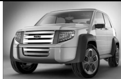
Called the Model T of the 21st Century, Ford's hydrogen powered Model U concept car will be on display at the auto show.

In addition to all the exotic new models from Ferrari, Lamborghini, Maserati, Bentley and Rolls Royce, an example of the exciting array of concept vehicles on display will be the Ford Model U, which will be introduced to the media by