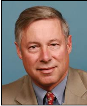
Rep. Fred Upton, R-MI,

Congressman Fred Upton, R-Mich., a champion of the auto industry, has been named chairman of the House Energy and Commerce Committee for the 112th Congress. The Energy and Commerce Committee is one of the most powerful committees in the House of Representatives. It has the largest non-tax jurisdiction and oversees a wide range of issues that affect the health, safety and commerce of the American people. Importantly, it is the lead committee on nearly all matters that impact the auto industry and has direct oversight of the Department of Transportation and the Environmental Protection Agency, which regulate safety, fuel economy and auto emission standards.