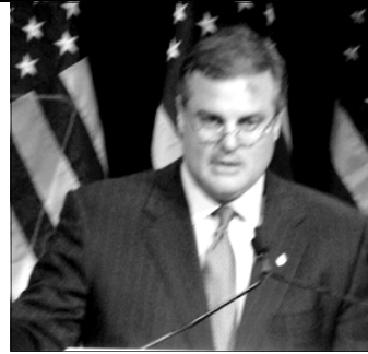
Sen. Mark Pryor (D-Ark.)

Sen. Mark Pryor (D-Ark.) stressed the growing annual deficit and eight trillion dollar national debt and said, "We have to get our fiscal house in order." Thus, he could not support total repeal of the estate tax. A more likely outcome, said Pryor, would be bi-partisan compromise legislation that