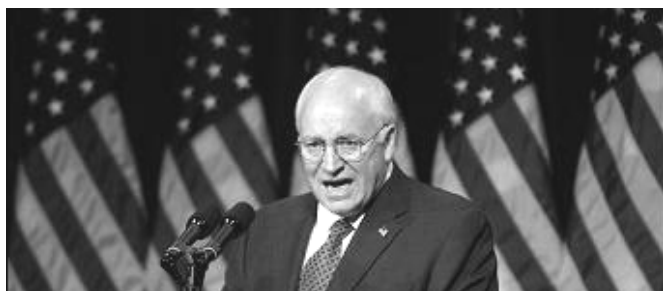
Vice President Dick Cheney

Death Tax, Total Loss Vehicles, Right to Repair & LIFO Top Legislative Agenda