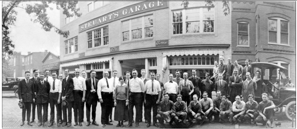
The Steuart Lincoln-Ford Service Garage in September 1923, before it became Martens Cars of Washington.