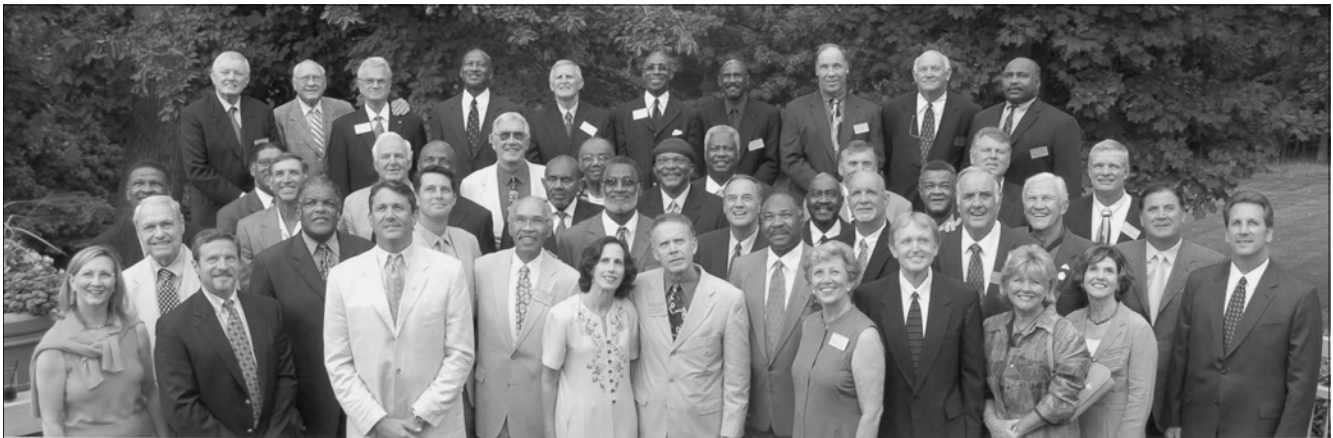
WANADA representatives interspersed with football and basketball Hall of Famers at the 2004 BMC. At right, top to bottom, Hall of Famers Oscar Robinson, Bill Dudley and Lem Barney at Sunday's tournament.