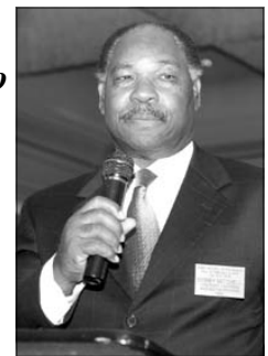
Come join Bobby and 41 of his sports legend friends.

Not only are we looking to set another fundraising record for the benefit of the Leukemia & Lymphoma Society, the Bobby Mitchell Hall of Fame Classic offers a rare opportunity for Washington area dealers to golf and mix with over 40 Hall of Fame sports legends, including the latest “Famers” to sign on: Harlem Globetrotter legend Meadowlark Lemon, former Congressman and Seattle Seahawks great Steve Largent, and Milwaukee Bucks star Wayne Embry. They will join such notables as Bears' Gale Sayers, Los Angeles Rams' Deacon Jones, Milwaukee Bucks'