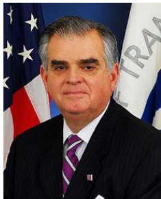
DOT Secretary, Ray LaHood